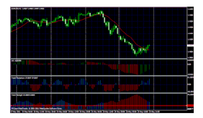
Support And Resistance EA V1.02.mq4 1